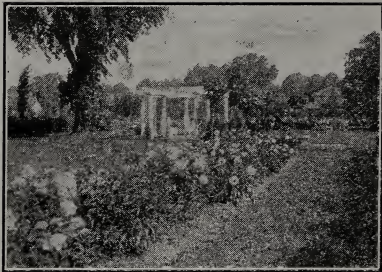
WASSENBERG GARDENS VAN WERT, OHIO